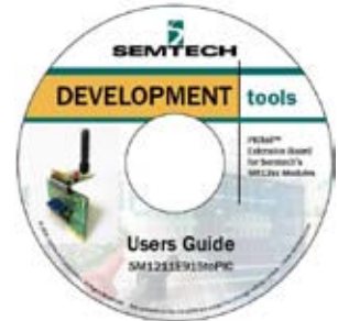
User's Guide (CD)