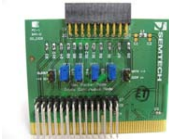
PICtail™ / PICtail™ Plus extension board