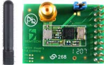
SM12xx RF Module + 915 MHz helical Antenna